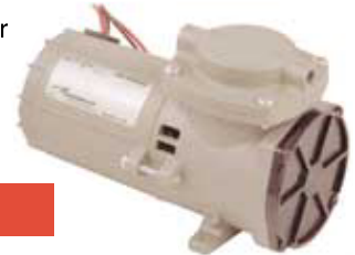
BMR-444 Optional Air or Vacuum Pump