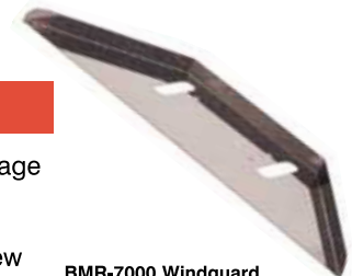
BMR-7000 Windguard For Vacuum, Air, and Electric Stop Arms. Reduces in-motion blade flutter caused by back draft.